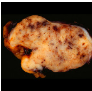
Image of a 6.5-cm GIST of the stomach.

R1; n = 177) had a median overall survival of 8.7 years compared with 5.3 years in patients with R2 resection (P = .0001). When the analysis excluded those patients who had progressing disease at the time of surgery, the median overall survival for the R0/R1 group was not reached compared with 5.1 years in the R2 group (P = .0001).