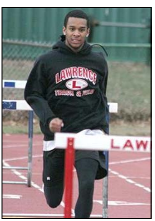
The champ in action.

400-meter dash the next week at the Central New Jersey Group III Sectional Championships. The 400-meter relay team he belongs to ran the second-