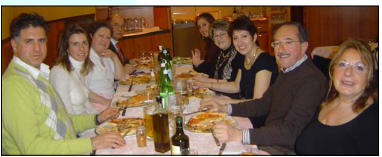
GISTers meet over pizza and discuss treatment issues at first national Italian patient meeting.