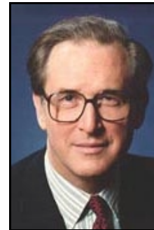
Sen. Jay Rockefeller

Sen. Olympia Snowe (R-Maine), ranking member of the Senate Finance