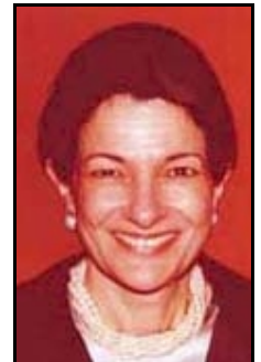
Sen. Olympia Snowe

Committee, and Sen. Jay Rockefeller (D-W.V.), chairman of the Senate Finance Committee, announced the launch of the national campaign for the act. Several cancer patients spoke at the press conference, joined by representatives from a host of cancer organizations.